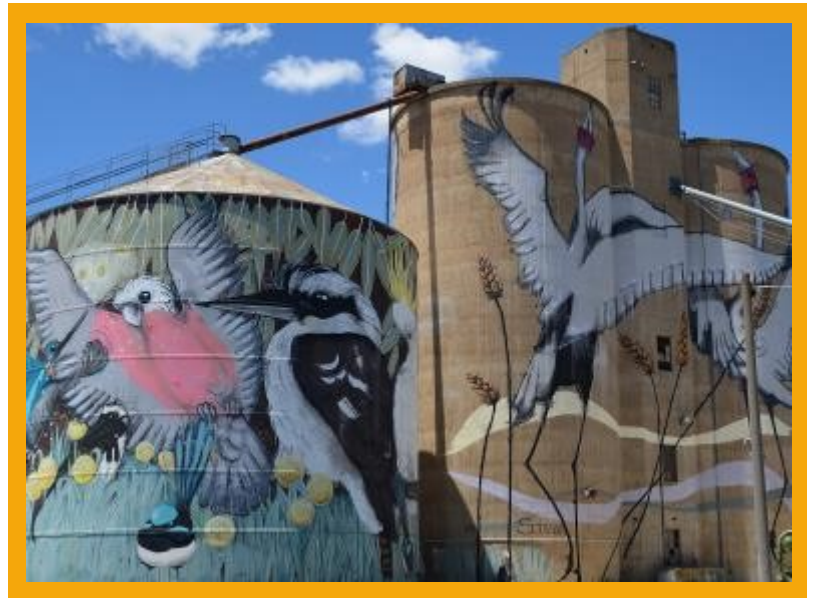
Silo art anticlockwise from bottom left (by background colour), Goorambat, Devenish, St James, Tungamah.