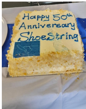
50th Anniversary Cake (with footprint)